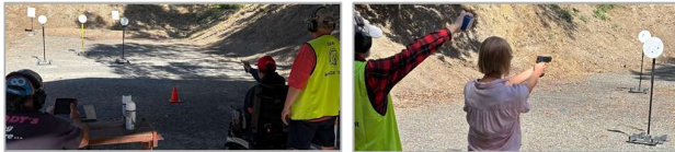
Safe and Inclusive

The 2025 SSAA Tasmania Speed Steel State Titles were held at the Mitchell Range on 15 th February 2026, hosting 21 club and intrastate competitors.