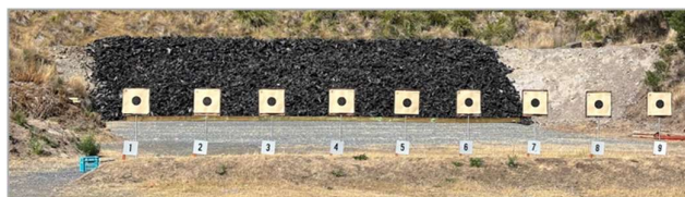
Upgraded Range A butt.